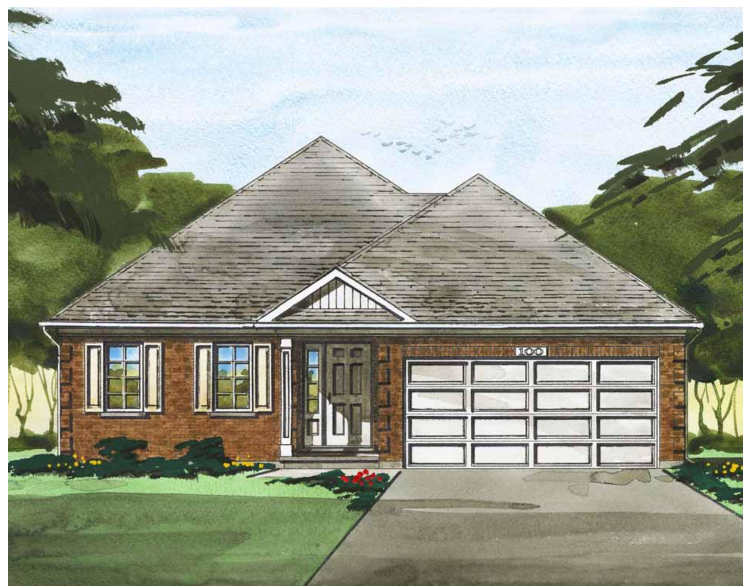
ELEVATION A (Artist's concept)

All dimensions are approximate and generally comprise the greater width by the greater length. Actual usable floor area may vary from that stated, which includes open areas and finished below grade areas where applicable. Appliances are not included. Elevation renderings are artist's concepts. All floor plans and elevations are copyrighted © 2005 Tillsonburg Developments Inc. E&OE. October 2010